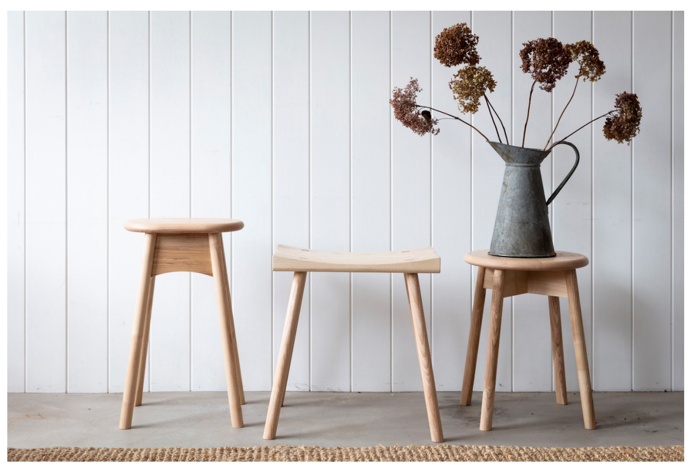
The three stools made for The National trust by students on our Professional Course.

A whiskey presentation box made for University of Oxford Botanic Garden & Arboretum by students at the Sylva Wood School using timber from the gardens, highlighting the value of the local wood chain.