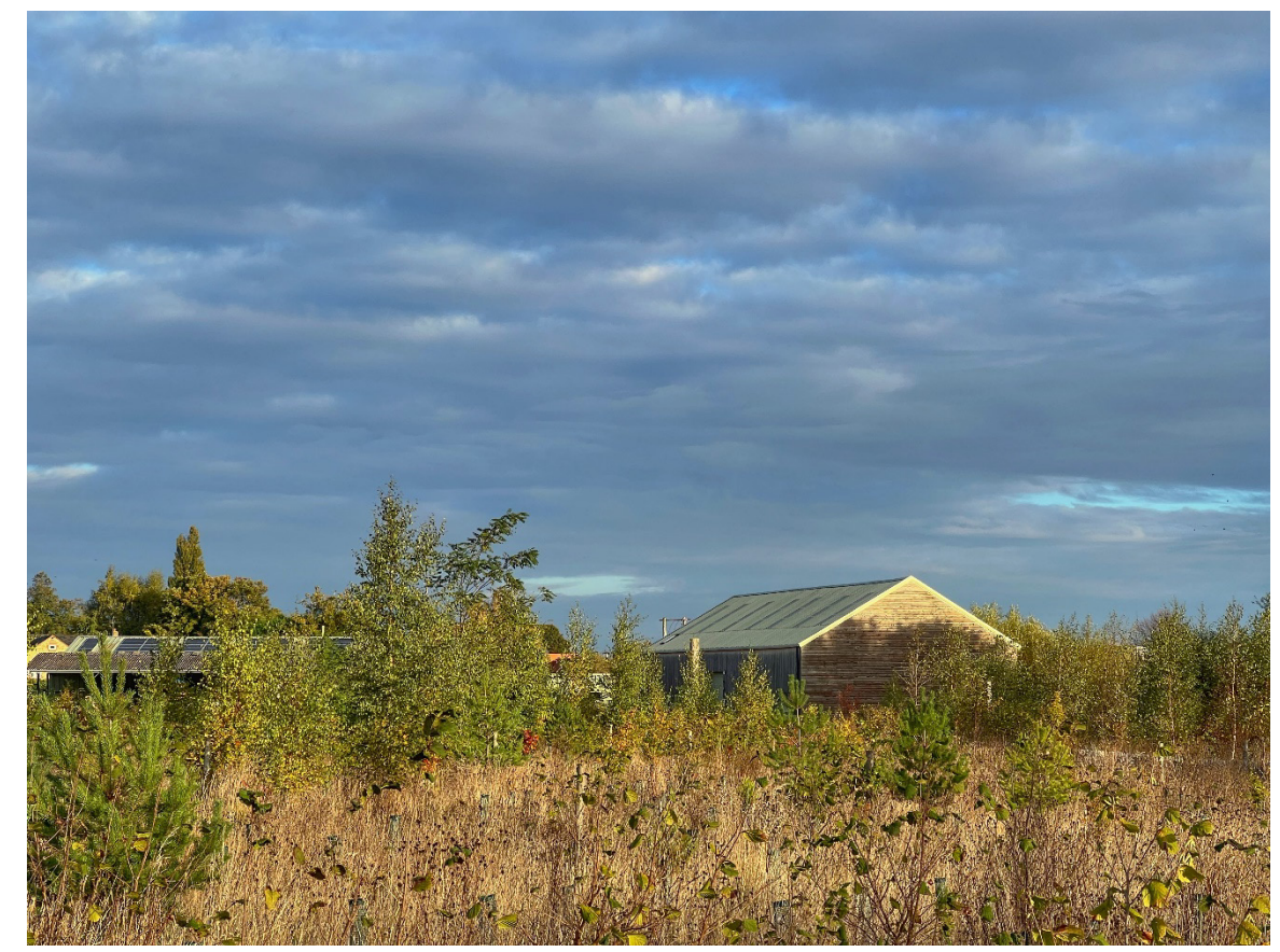
Trees growing in the young Future Forest surround the wooden-clad buildings of the Sylva Wood Centre.

'[I am delighted that the Sylva Foundation supports] a modern-day clarion call for the creation of a new wood culture that may help to ensure a sustainable and enjoyable future for us all.'