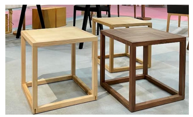
Joined and Jointed tables made by students at the Sylva Wood School

In 2022, we launched a new collaboration with the National Trust to design and make furniture from ash trees felled at one of its estates. The three stools were designed by our Head of Wood School, and later made by students on our Professional Course. The stools were sold by the National Trust in summer 2022.