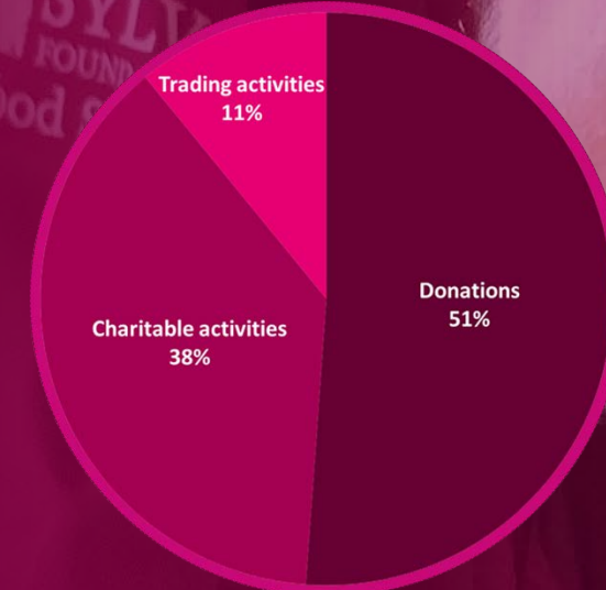
Income 2018-19. Bank interest contributed less than 1%.

Total income for the year was £766,420 (2017-18: £492,644). £390,892 (51%) of income was received as Donations, of which 90% was restricted to specific activities. The majority of income for Charitable Activities (£290,022; 38%) came from performancerelated grants. Income from Trading Activities provided £83,458 (11%), including £53,202 from business leases/rentals at the Sylva Wood Centre.